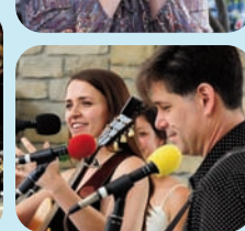
Row 1: Winter Old Time Barn Dance 2/12