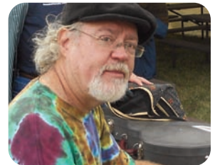
Danada Fall Festival 10/12